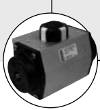
Type 2050QT Pneumatic Actuator