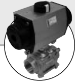
Type AV26xx Pneumatic Actuated Valve